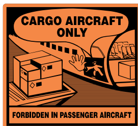
Cargo Aircraft Only 110 x 127mm